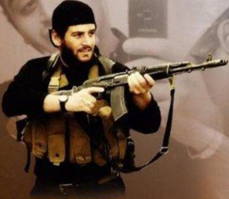
The Mujahid Shaykh Abu Muhammad al-'Adnani ash-Shami (May Allah Give Him Protection)

"It has reached us that some of you do not act due to their incapacity to reach military targets, or their finding fault with targeting those who are called "civilians," so they leave harming them, doubting the permissibility thereof. Know that inside the lands of the belligerent crusaders, there is no sanctity of blood and no existence of those called "innocents." This is not the venue for mentioning all of the evidences, for the list is too long; the least of which is dealing with them in just, as their warplanes do not distinguish between one who is armed and another who is unarmed, nor between a man and a woman. Know that your targeting those who are called "civilians" is more beloved to us and more effective, as it is more harmful, painful, and a greater deterrent to them. So go forth, O muwahhidin everywhere! It might be that you attain great reward or even shahadah during Ramadan.